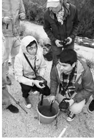
Students water quality testing at Struve Slough Below: High School Interns birdwatching in the wetlands

Watsonville Wetlands Watch (WWW) has been working to protect freshwater wetlands for over 20 years. Their Wetland Stewards program hires and trains 12 Pajaro Valley High School students as interns to teach a hands-on after-school program for elementary and middle schools in Watsonville. These interns learn about the plants, animals, and the ecology of the wetlands along with methods to teach this material to younger students. The high school role models inspire younger students to care about the